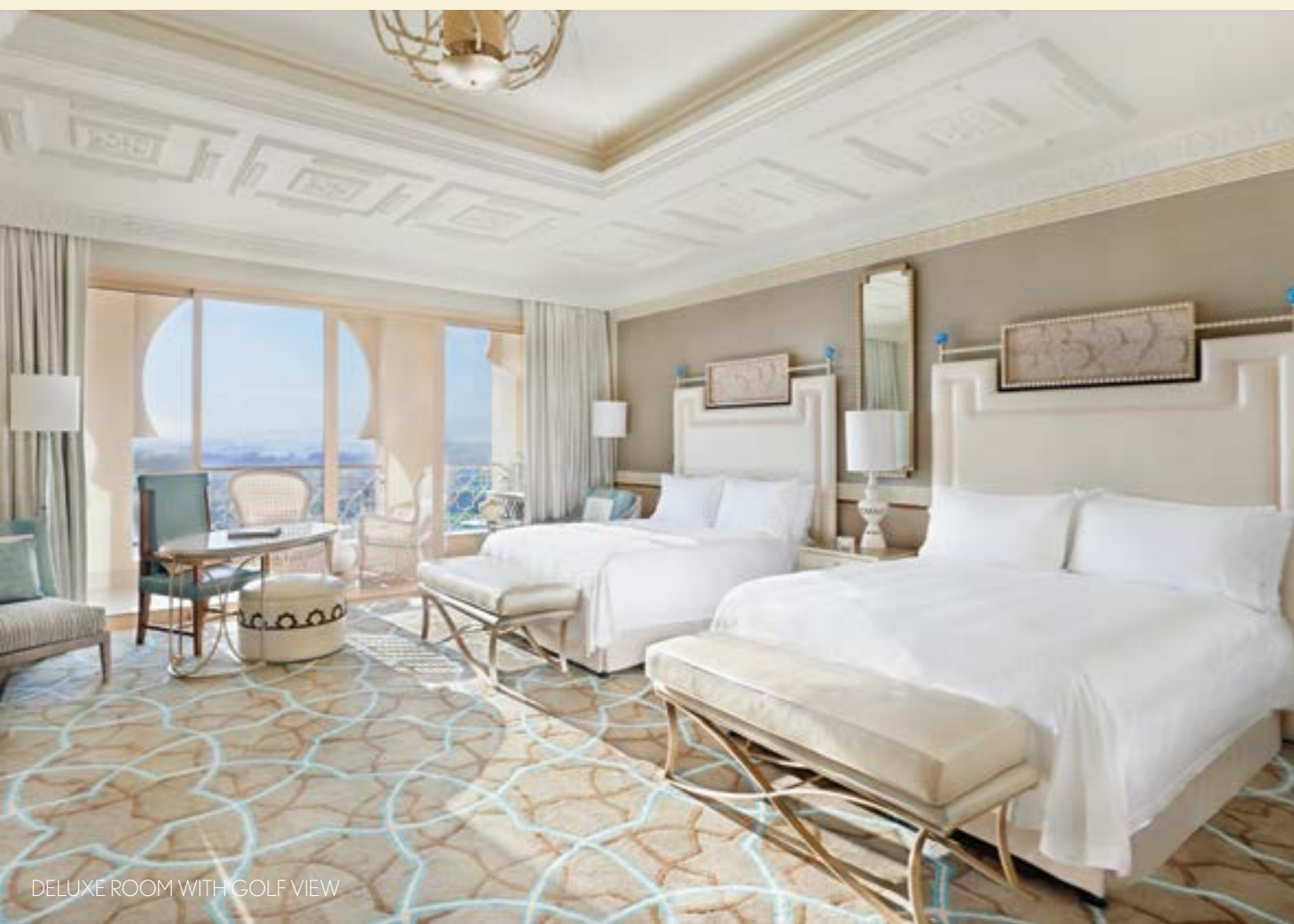
DELUXE ROOM WITH GOLF VIEW

The 346 deluxe rooms and suites reflect the palatial surroundings and offer the luxury of space and tranquility. Each room extends to over 56 square metres and offers panoramic views of the Arabian Sea, championship golf course and the majestic Al Hajar Mountains.