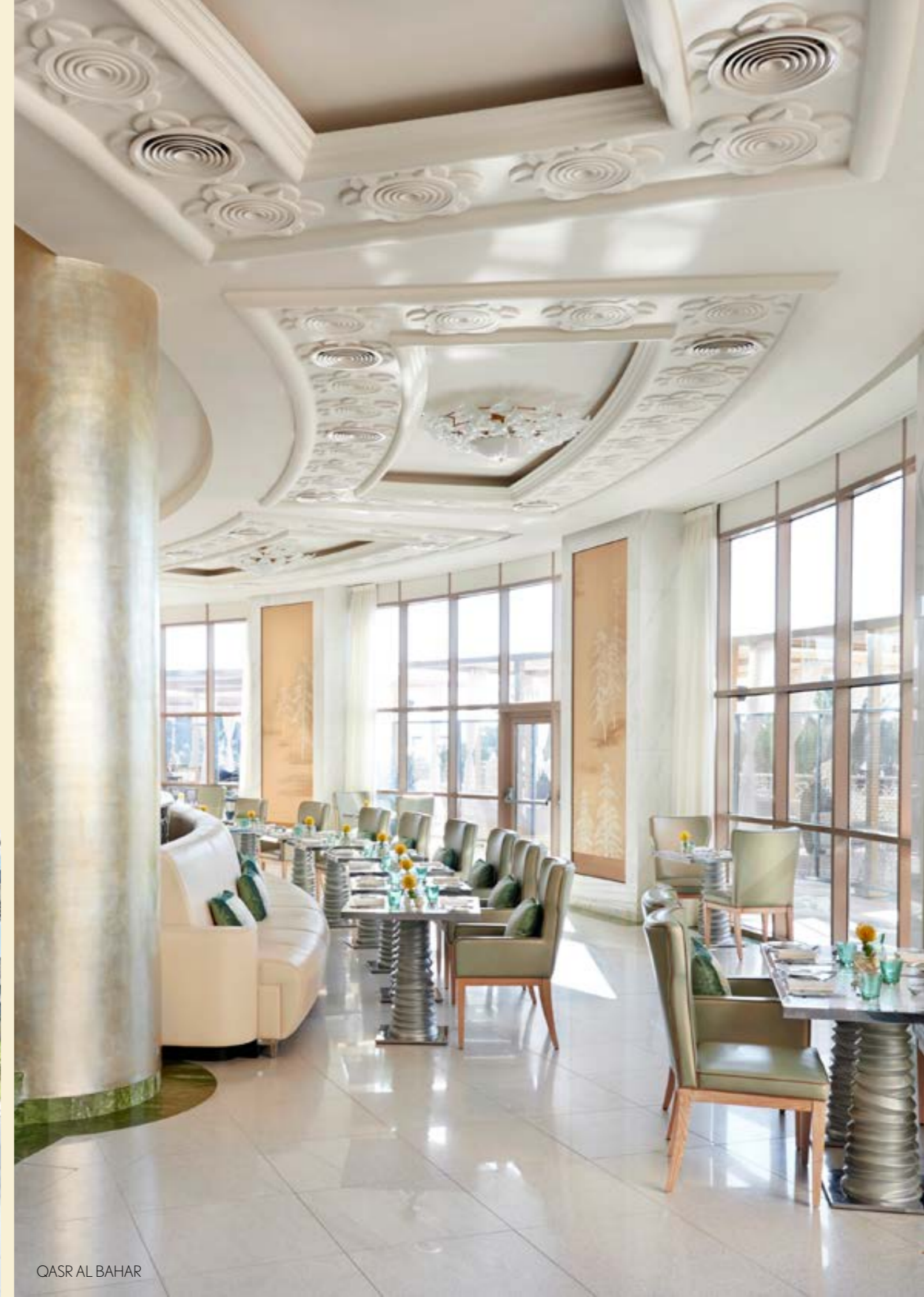
QASR AL BAHAR