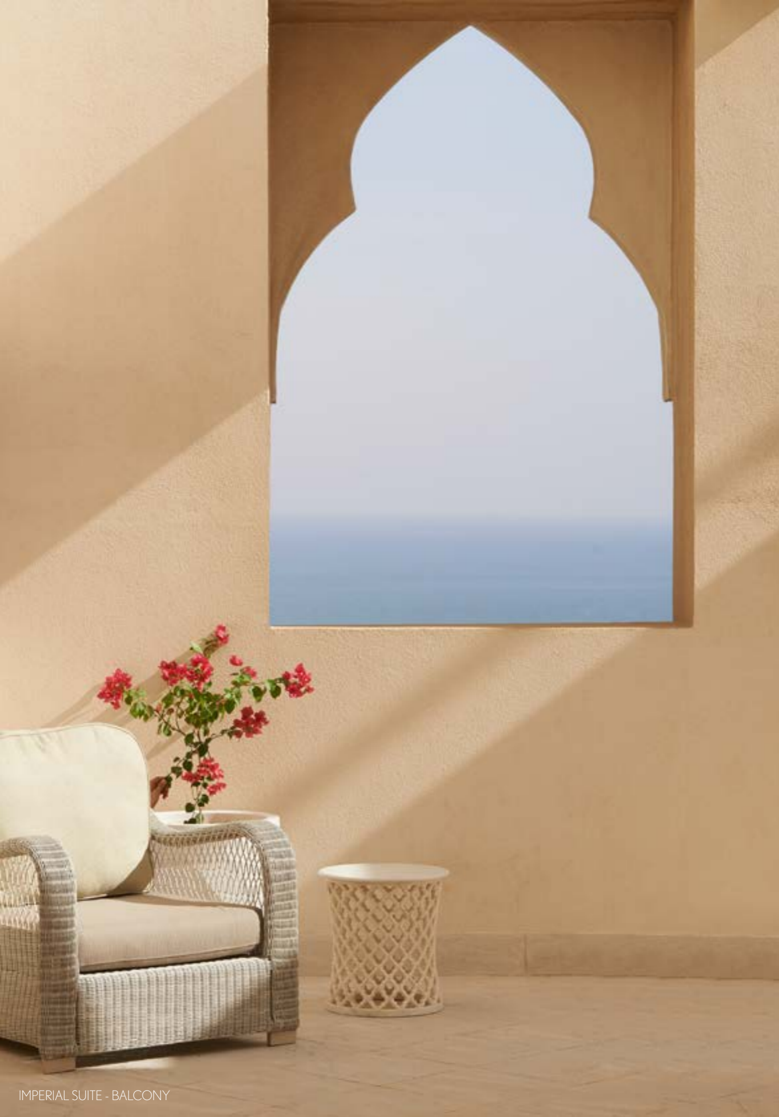
IMPERIAL SUITE - BALCONY