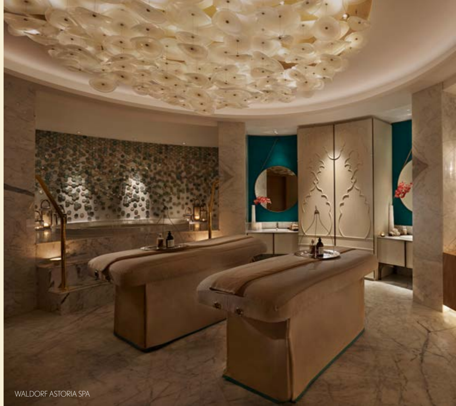
WALDORF ASTORIA SPA