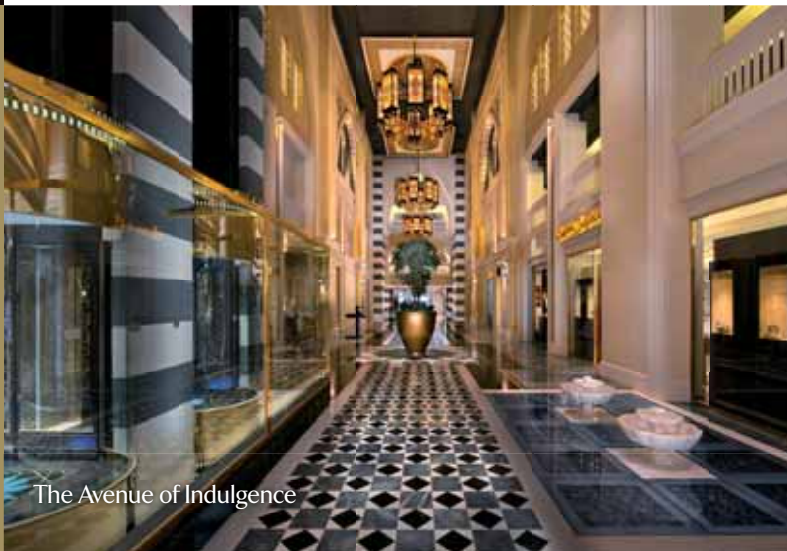
The Avenue of Indulgence