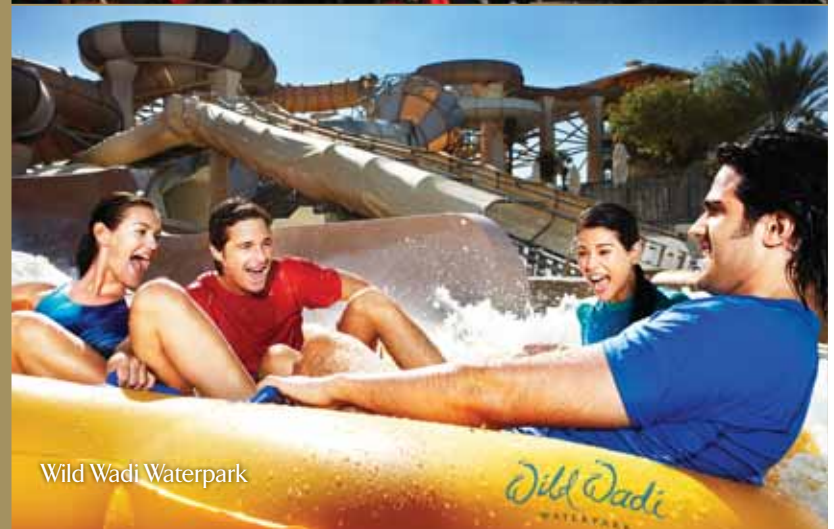
Wild Wadi Waterpark