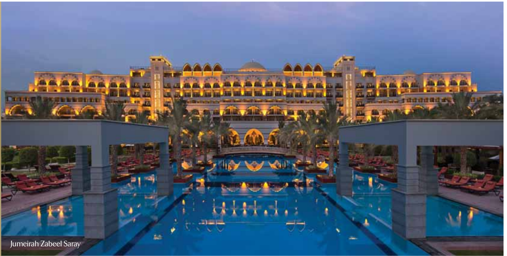
Jumeirah Zabeel Saray