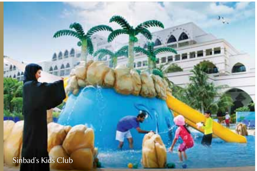
Sinbad's Kids Club