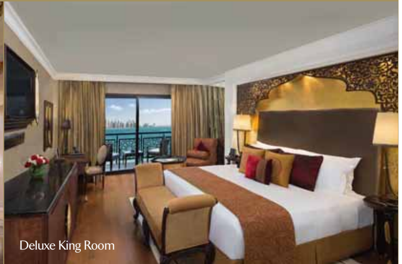
Deluxe King Room

Location | Situated on the West Crescent of Palm Jumeirah, Jumeirah Zabeel Saray is a mere 45-minute drive from Dubai International Airport.