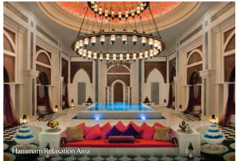
Hammam Relaxation Area

Talise Boutique | The Talise Boutique gives guests a chance to take home all the professional spa products used to create unique experiences at Talise Ottoman Spa. The boutique also offers a wide range of spa amenities such as candles, music and spa accessories.