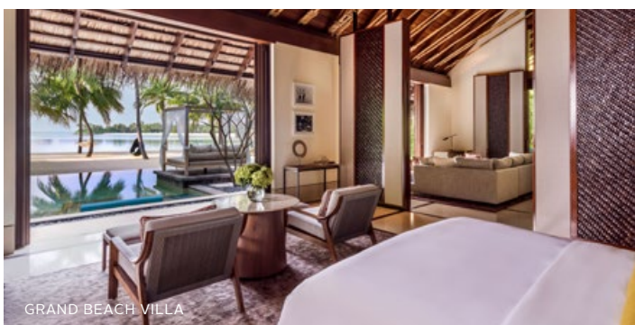
GRAND BEACH VILLA