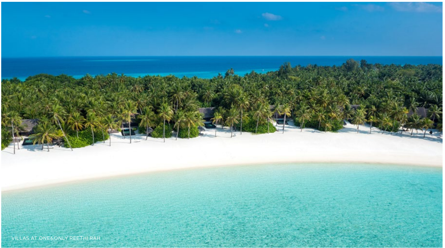
VILLAS AT ONE&ONLY REETHI RAH