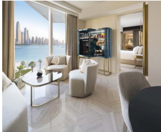
Above: Junior Suite Far left: Penthouse Left: Junior Suite