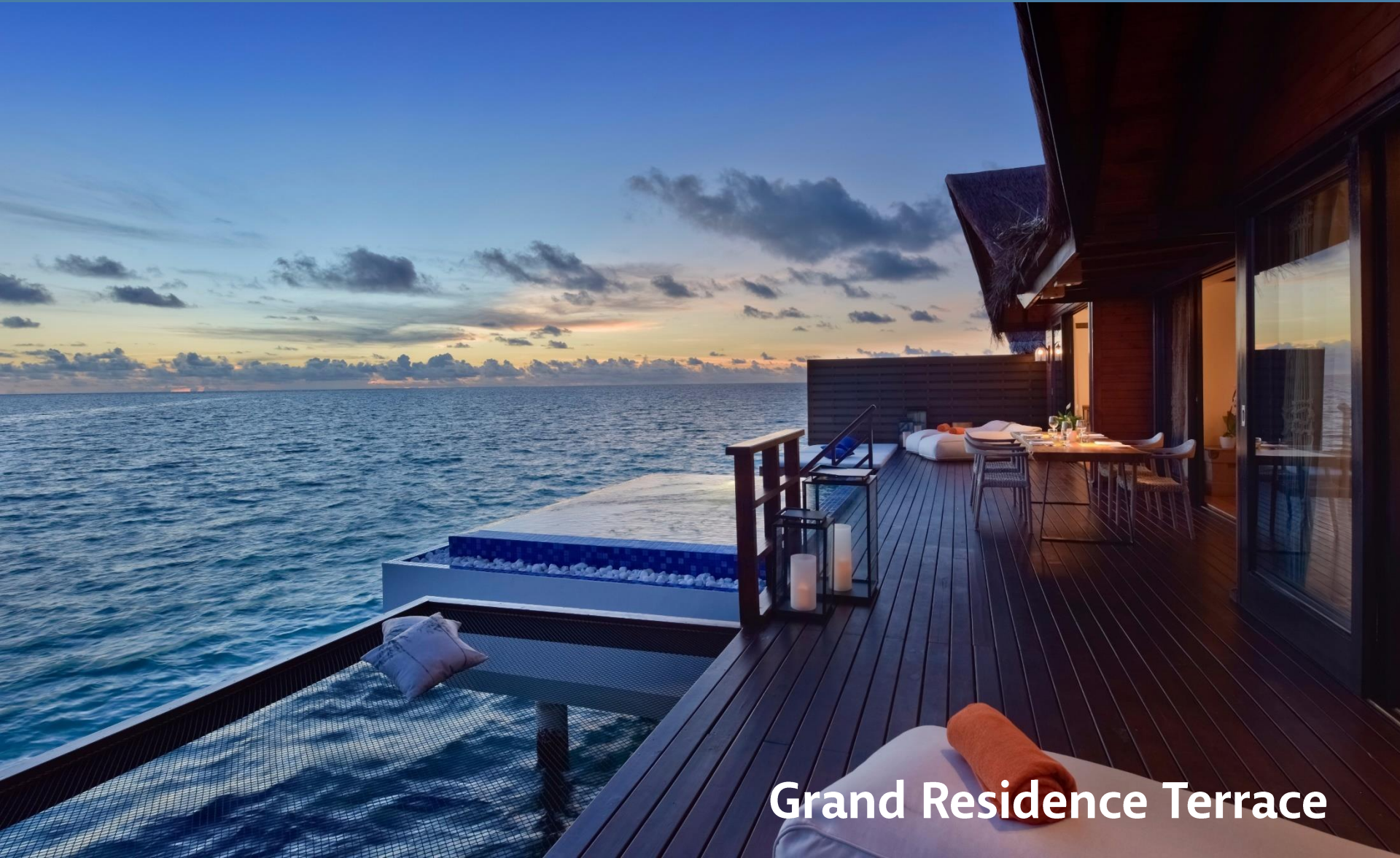
Grand Residence Terrace