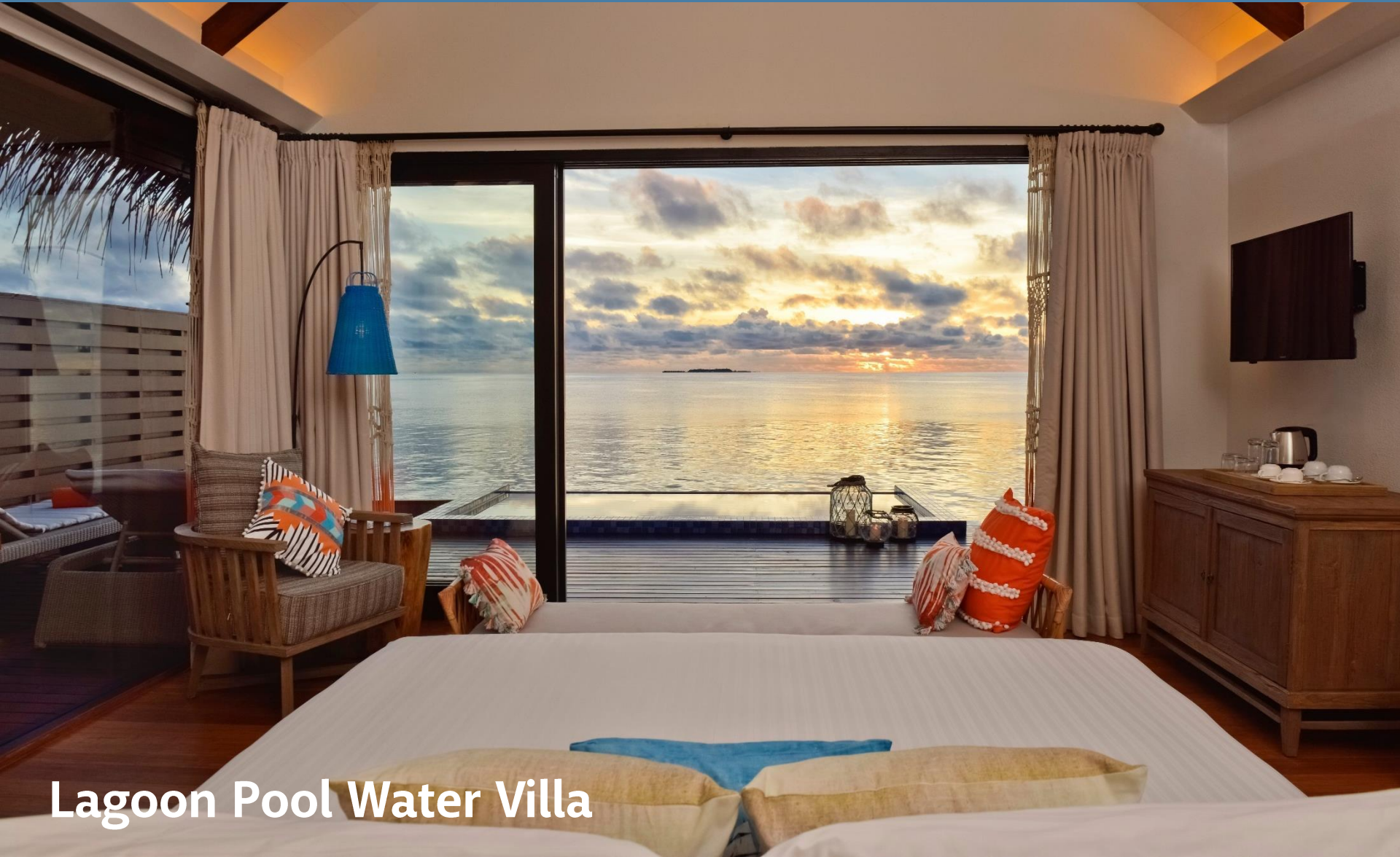
Lagoon Pool Water Villa