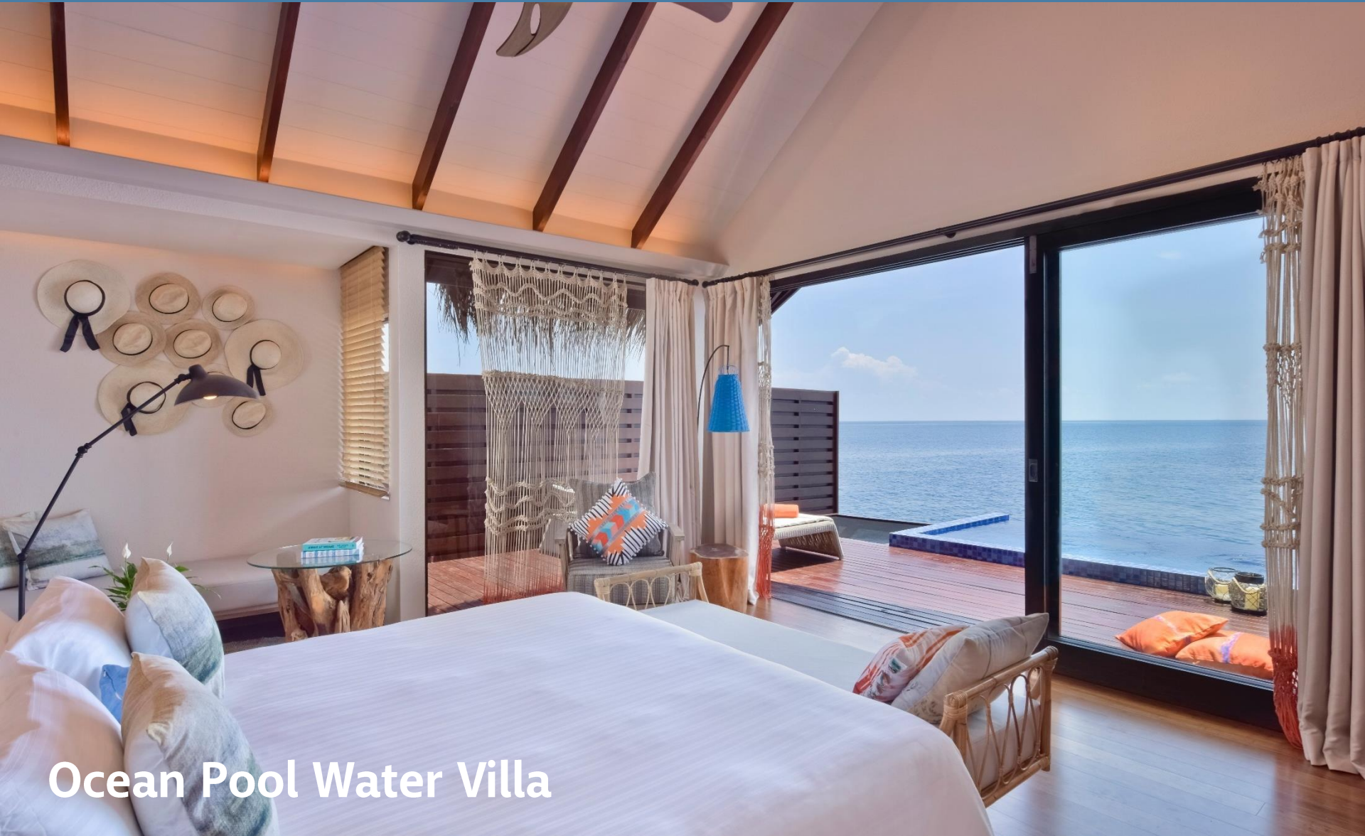
Ocean Pool Water Villa