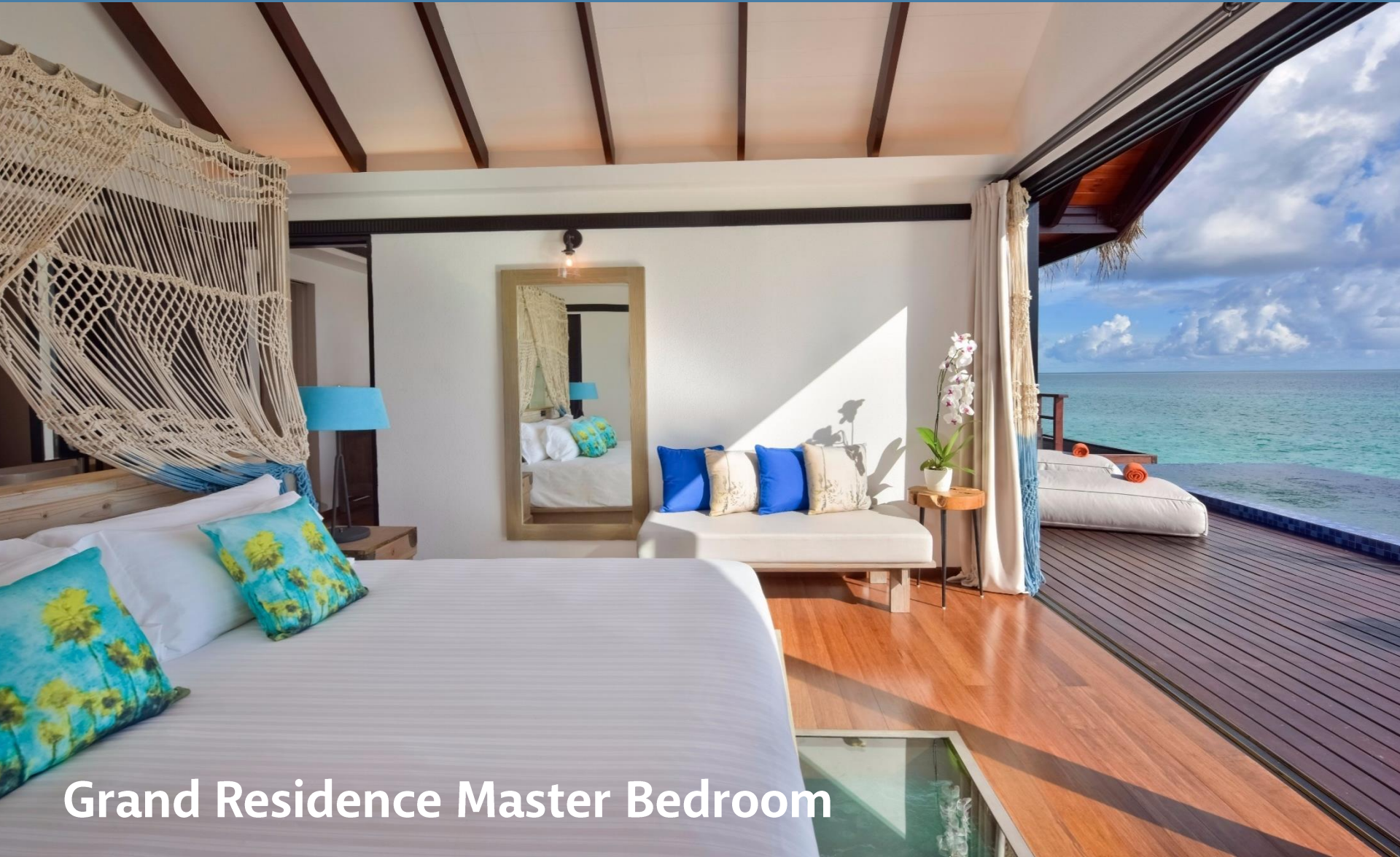
Grand Residence Master Bedroom