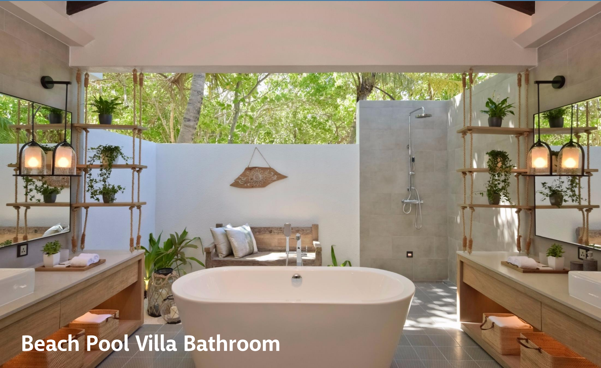
Beach Pool Villa Bathroom