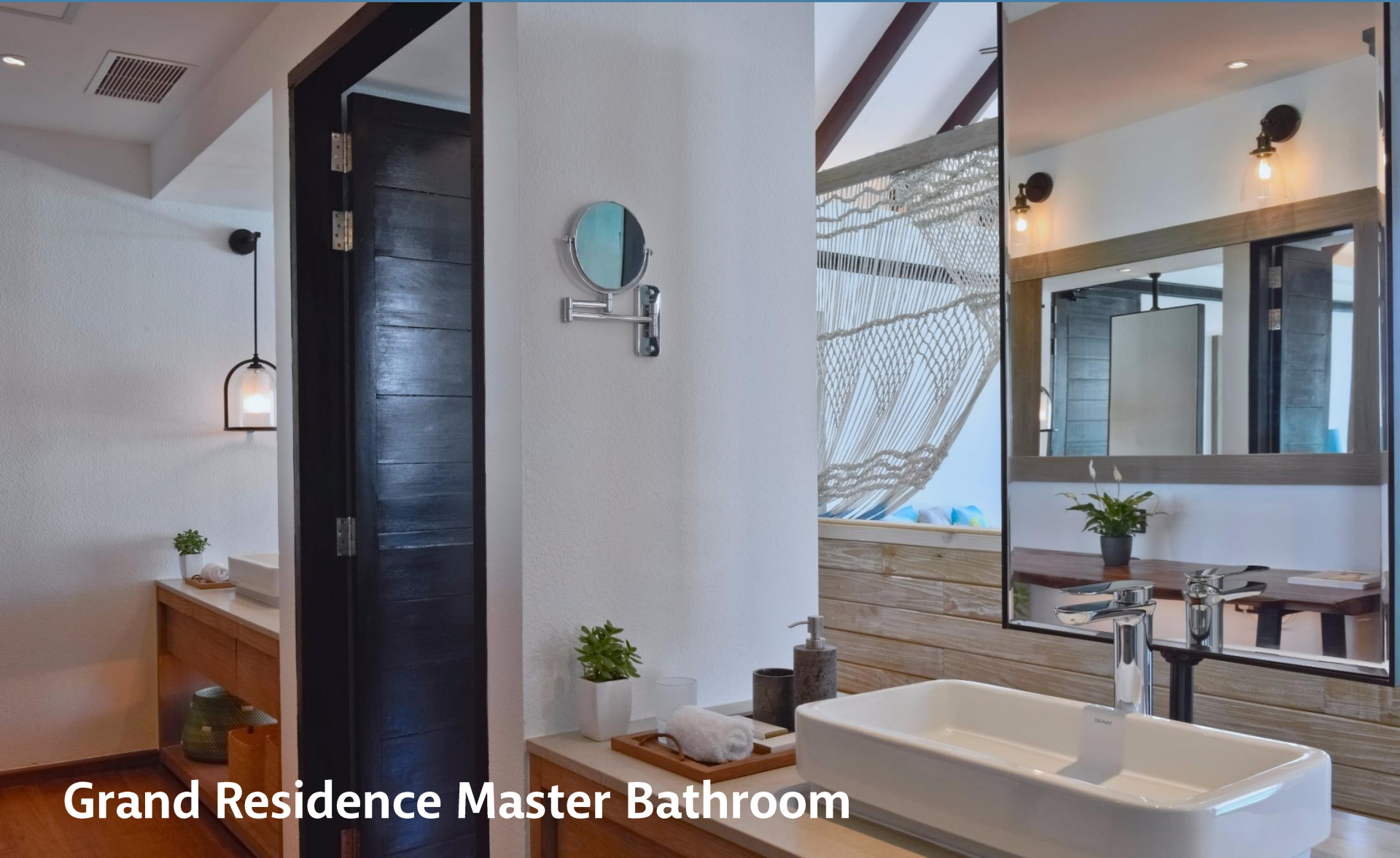
Grand Residence Master Bathroom