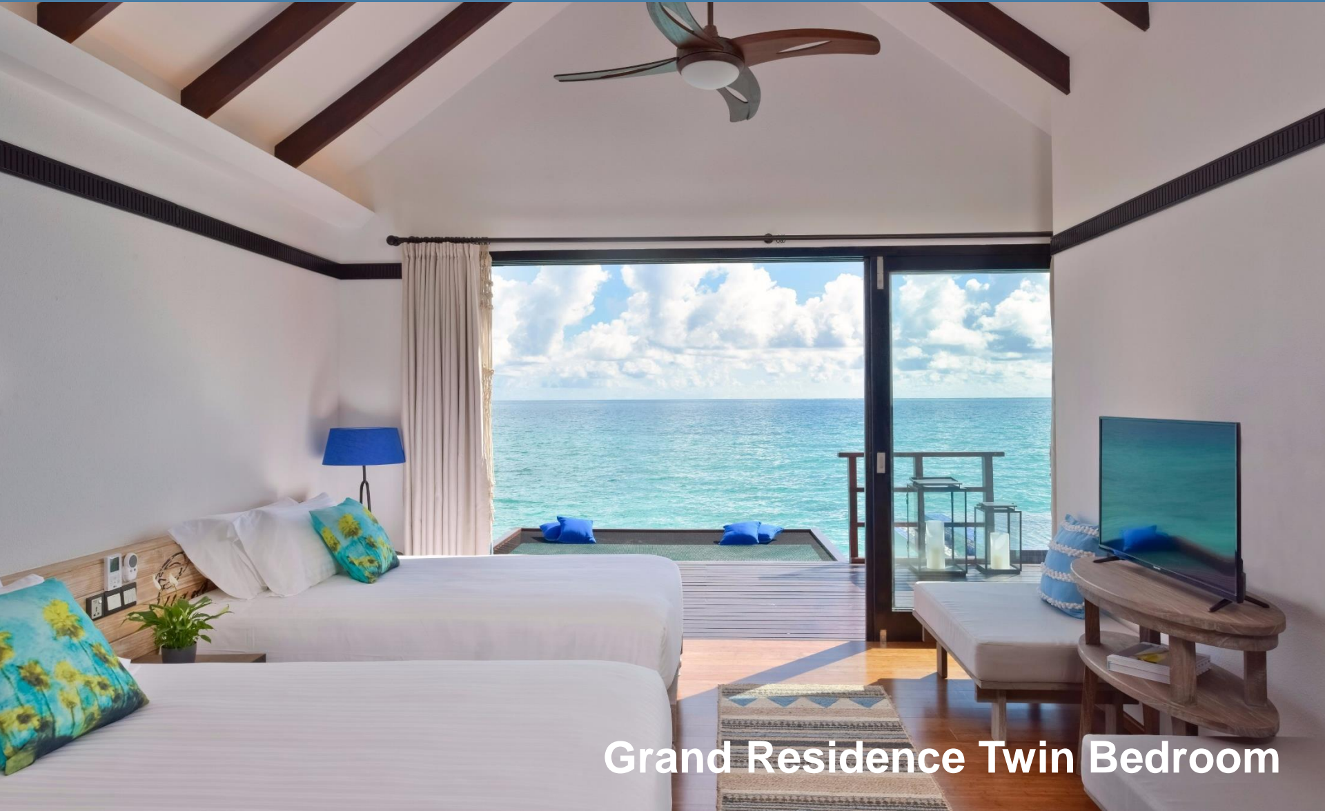
Grand Residence Twin Bedroom