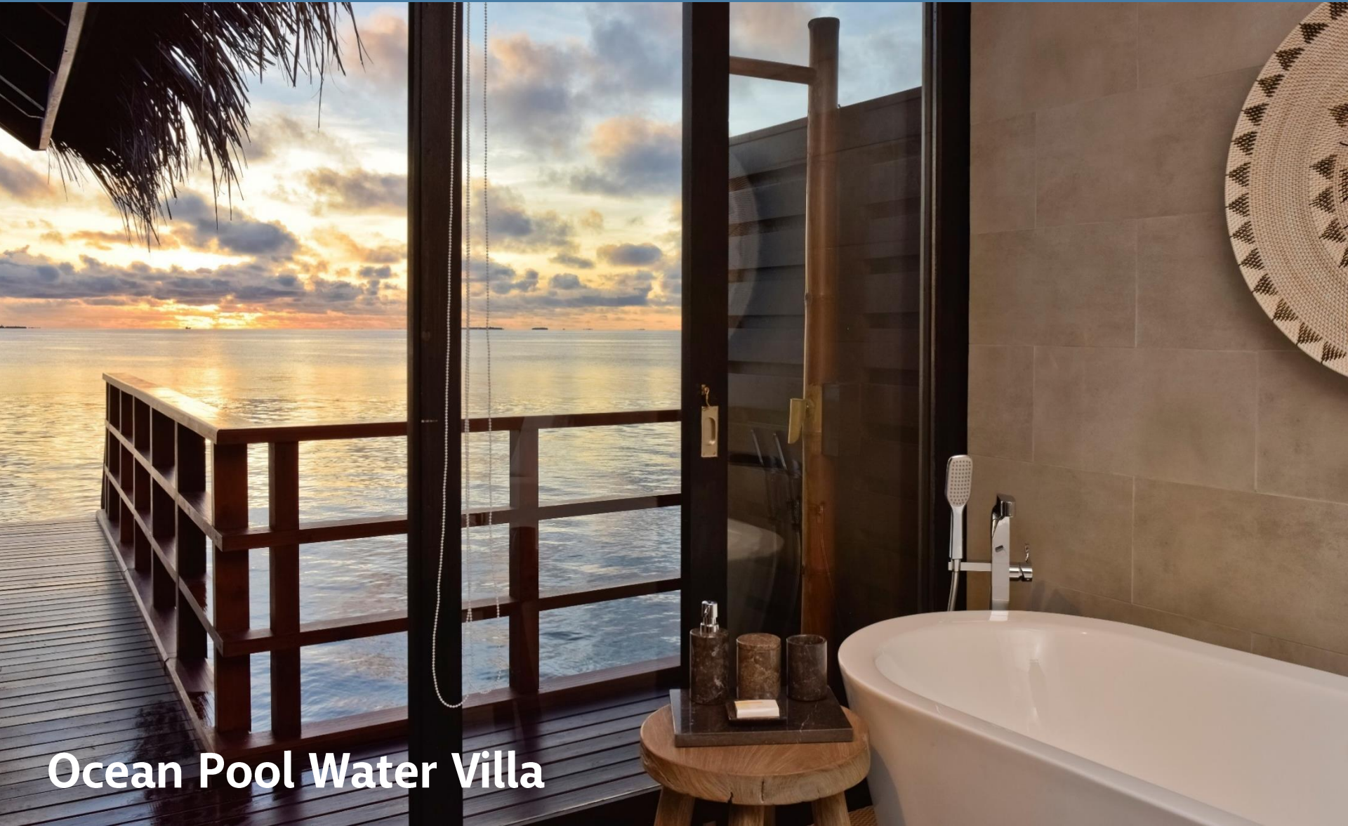
Ocean Pool Water Villa