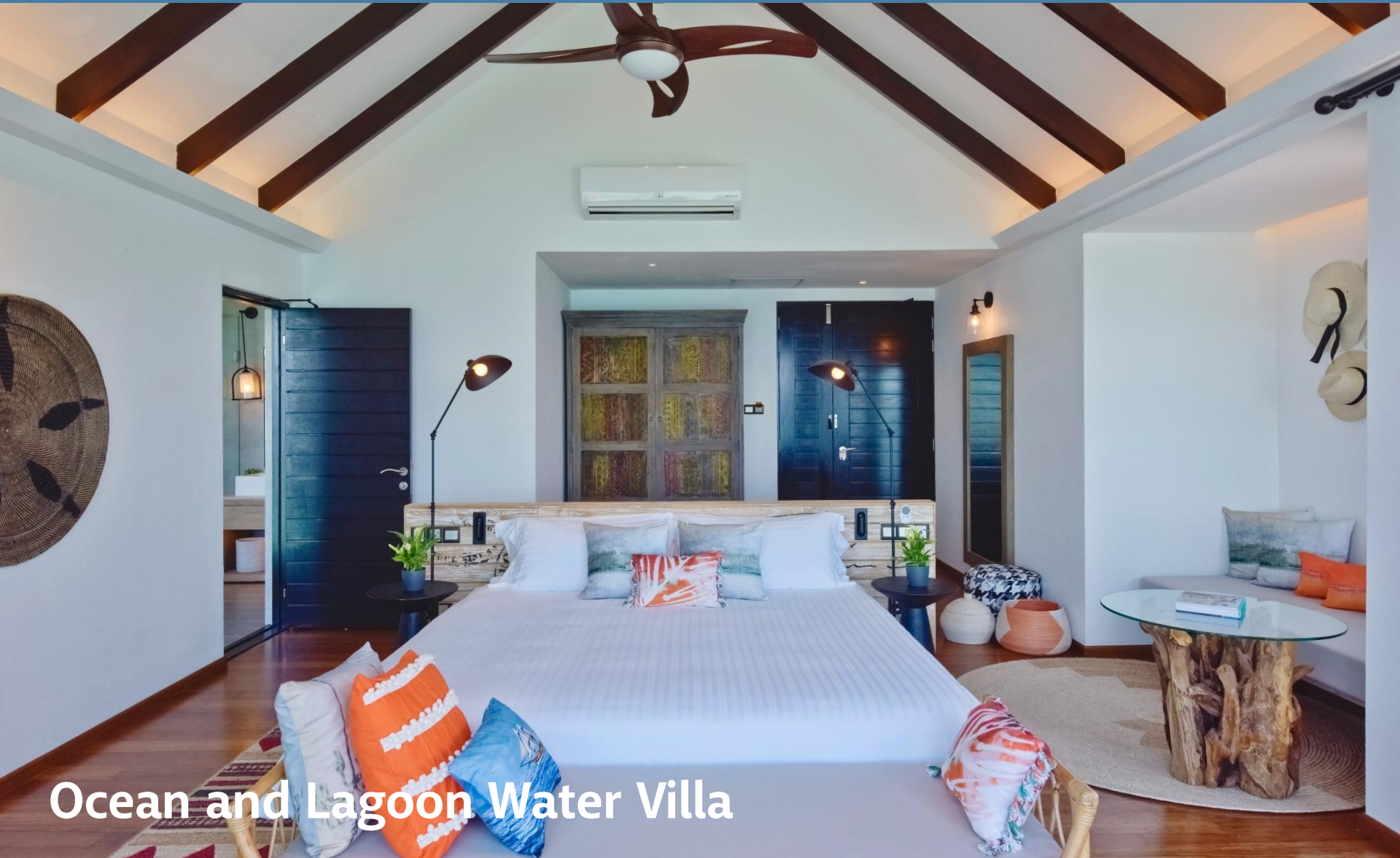
Ocean and Lagoon Water Villa