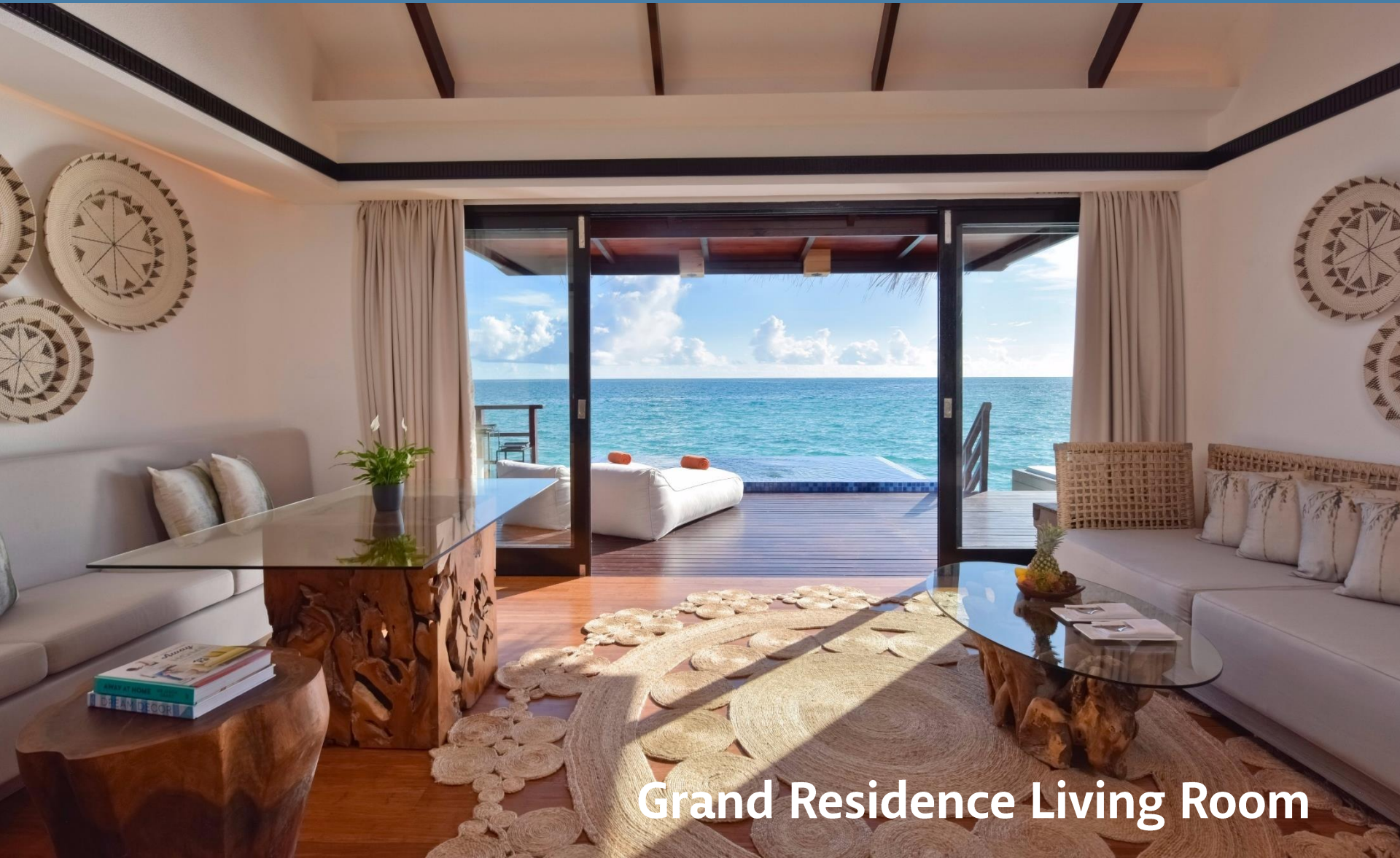
Grand Residence Living Room