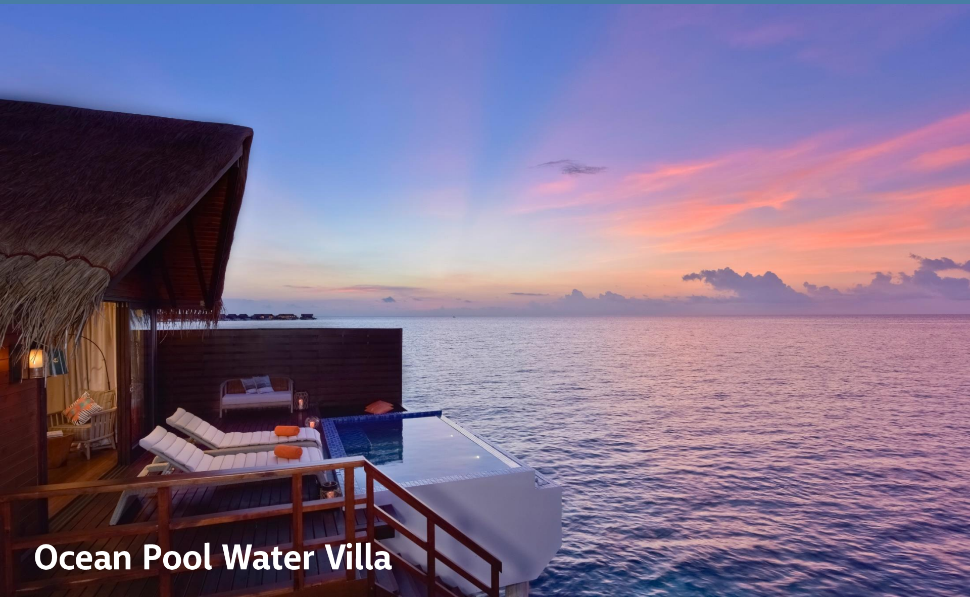
Ocean Pool Water Villa