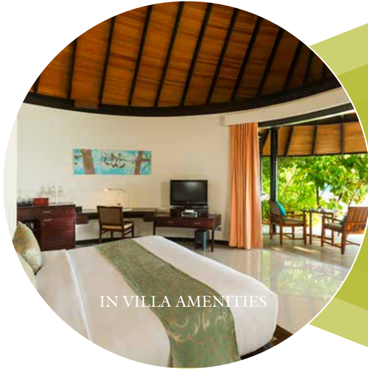
IN VILLA AMENITIES